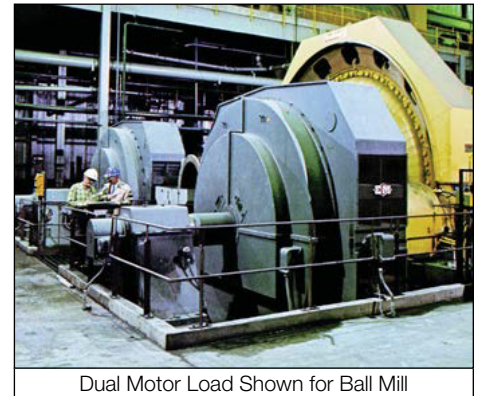
Dual Motor Load Shown for Ball Mill