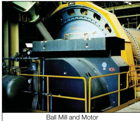
Ball Mill and Motor